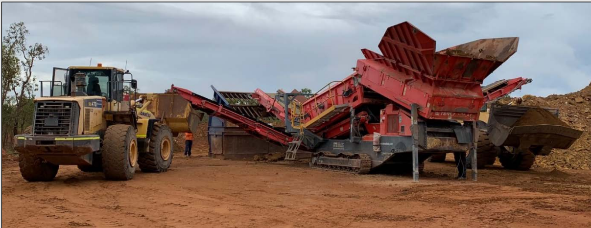
Figure 3: Screening to analyse variance in fraction size flitch

Access to site and accommodation was established to support the trial mining and other activities including a fire management program and general village maintenance was undertaken. Preparation and asset protection activities for the Kimberley wet season were carried out, with the accommodation village and site locked down at the conclusion of the trial mining program.