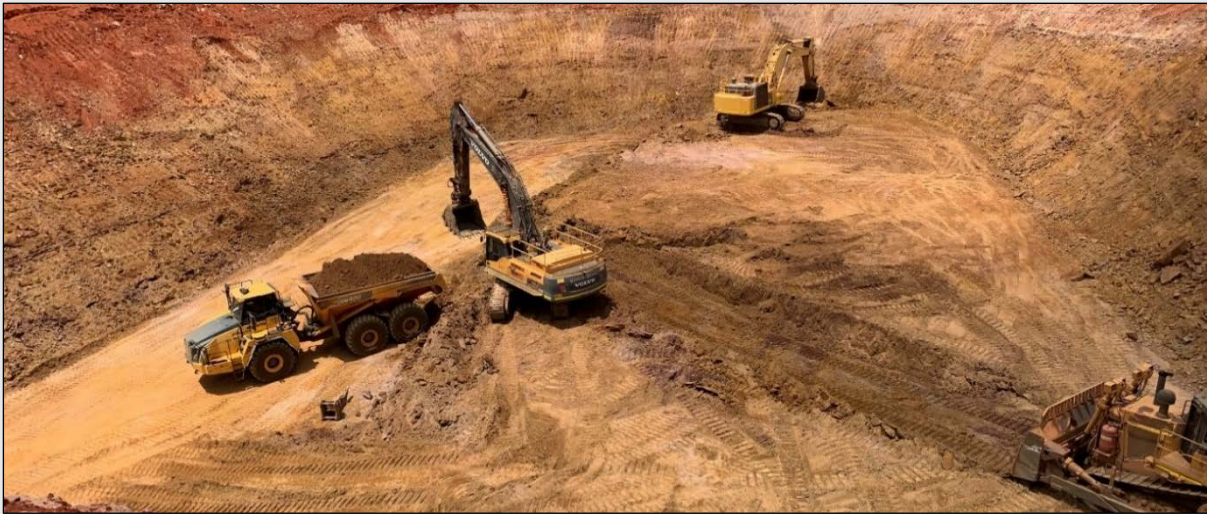
Figure 2: Dozer push sample collection