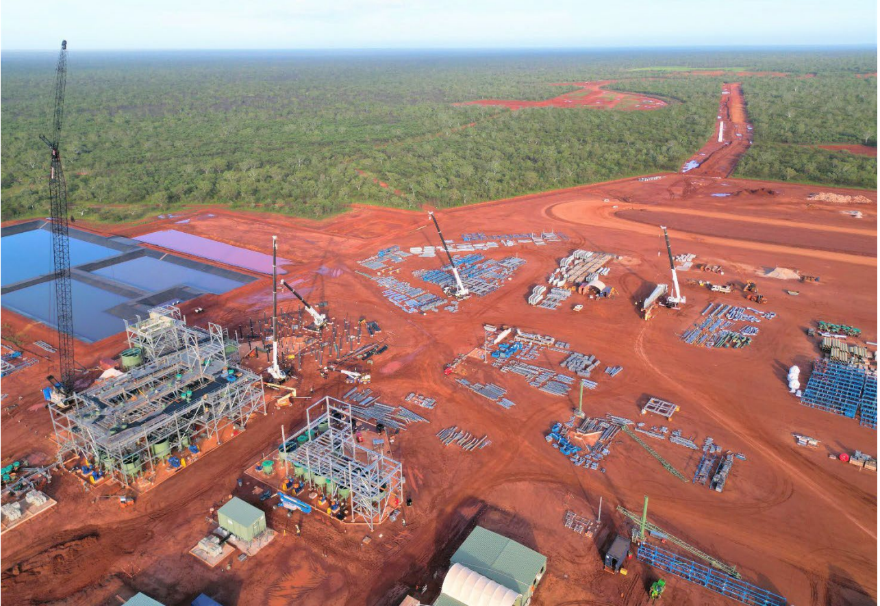
Image 2: Thunderbird Wet Concentrate Plant & Concentrate Upgrade Plant overview