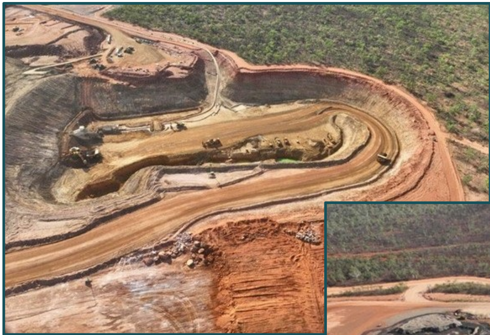
MINE DECEMBER 2023