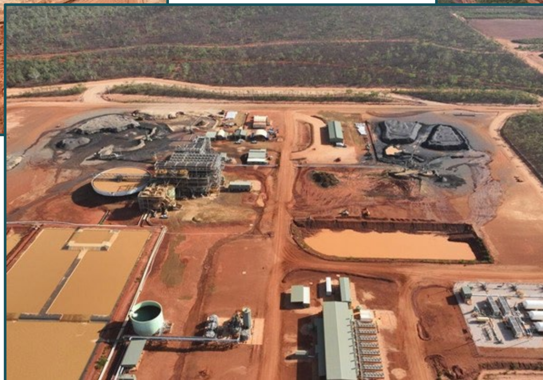
PROCESS PLANT HMC AND PRODUCT STOCKPILES DECEMBER 2023