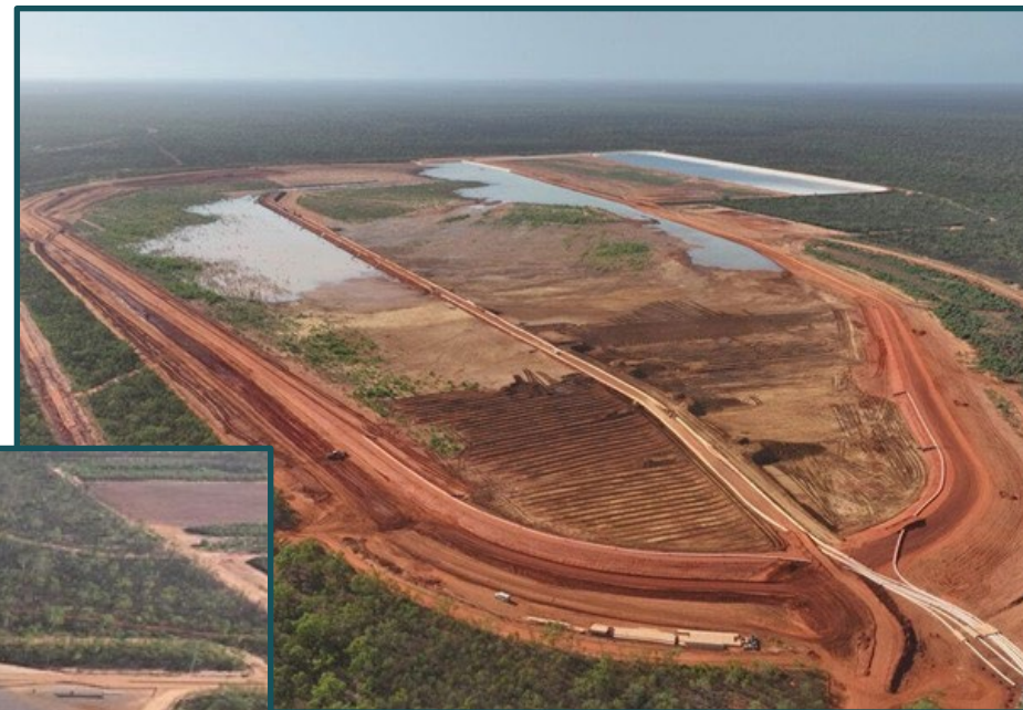
TAILINGS STORAGE FACILITY DECEMBER 2023