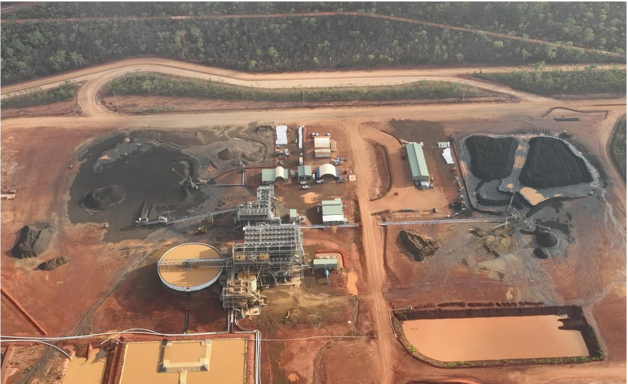
Figure 2: Thunderbird Process Plant site including Heavy Mineral Concentrate and product stockpiles (January 2024)