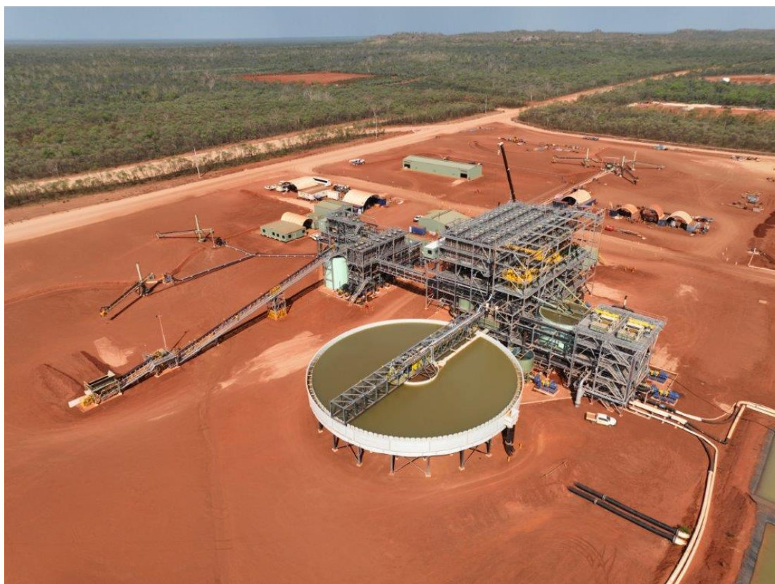
Figure 1: Thunderbird Process Plant site

During the reporting period, activities culminated in the completion of site construction activities for the flagship Thunderbird Mineral Sands Mine (Thunderbird) in the Kimberley region of Western Australia, with first ore production generated during October 2023. Zero lost time incidents were achieved across the construction, commissioning, and initial operating period, an outstanding achievement by the Kimberley Mineral Sands team.