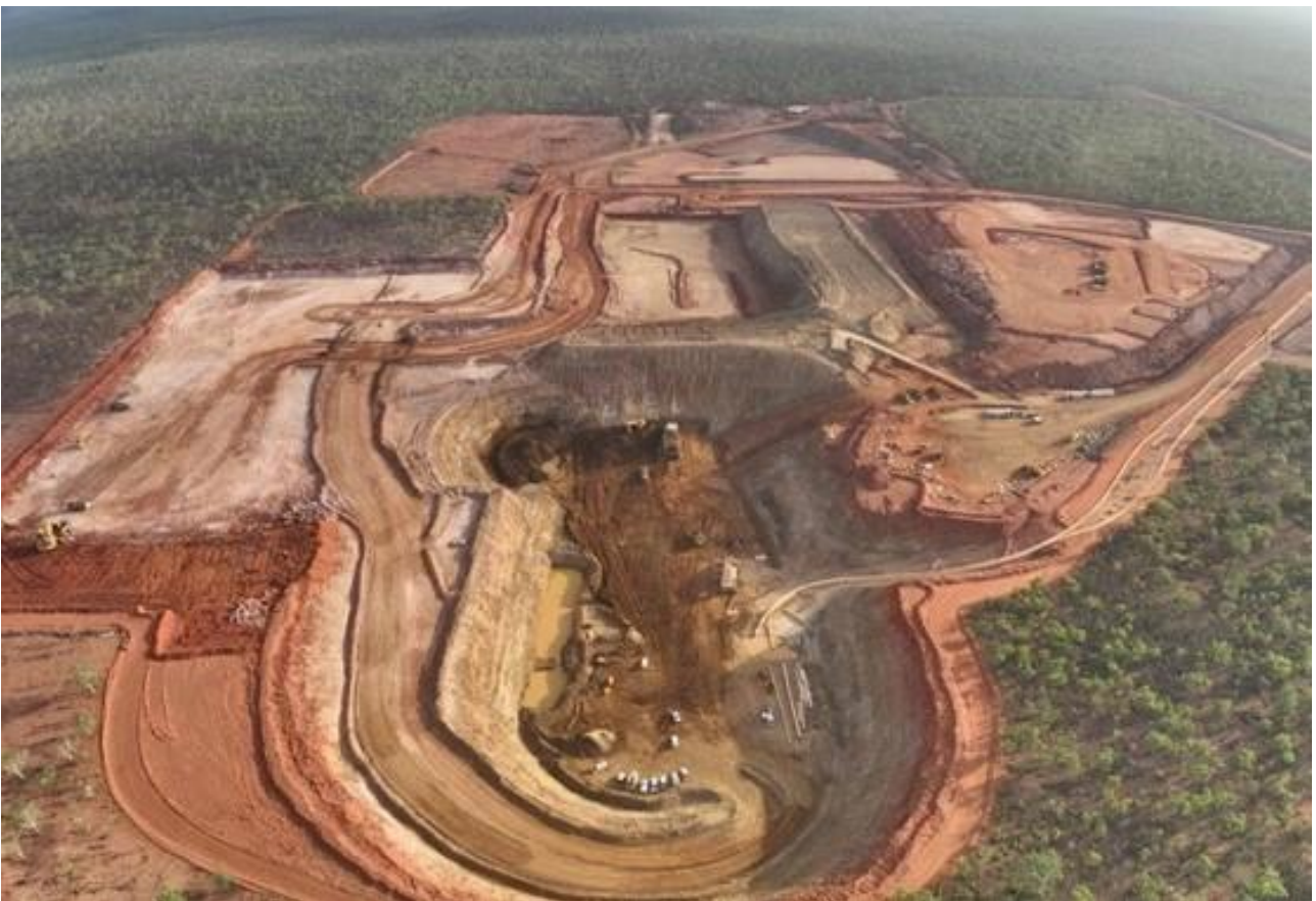
Figure 3: Mining operation during first Dry Mining Unit move (December 2023)